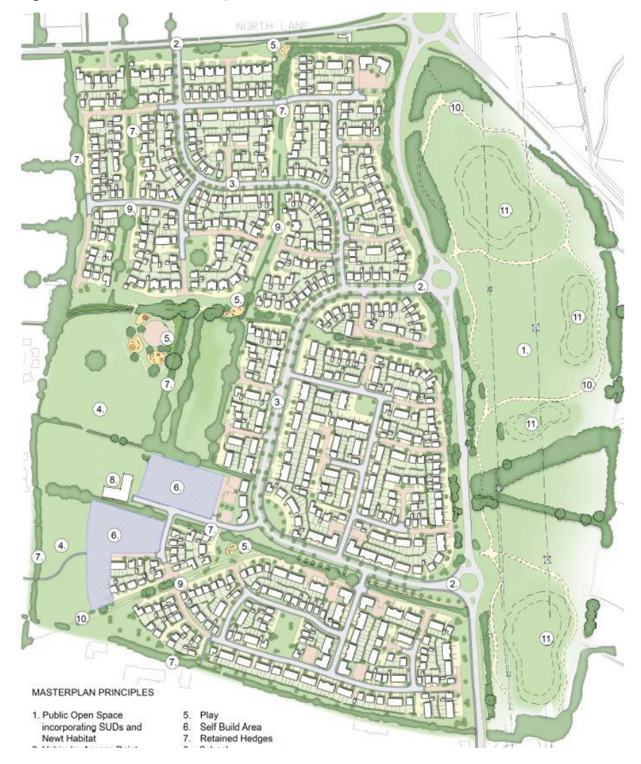
Figure 3 Illustrative masterplan

7. A large amount of POS will be incorporated into the proposals, with green infrastructure and play areas scattered throughout the residential development itself, whilst a single large area of POS will be created to the east, with a dual function of drainage and recreation. This area will be fitted with a network of footpaths that are well connected to the residential development.