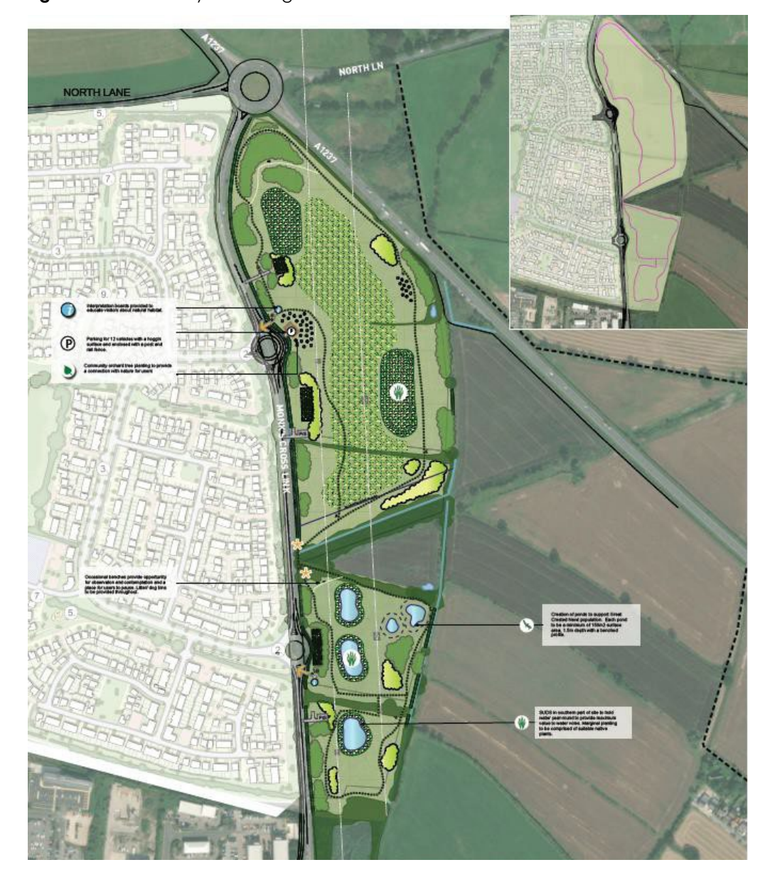
Figure 4 New Country Park designed to meet criteria for SANG