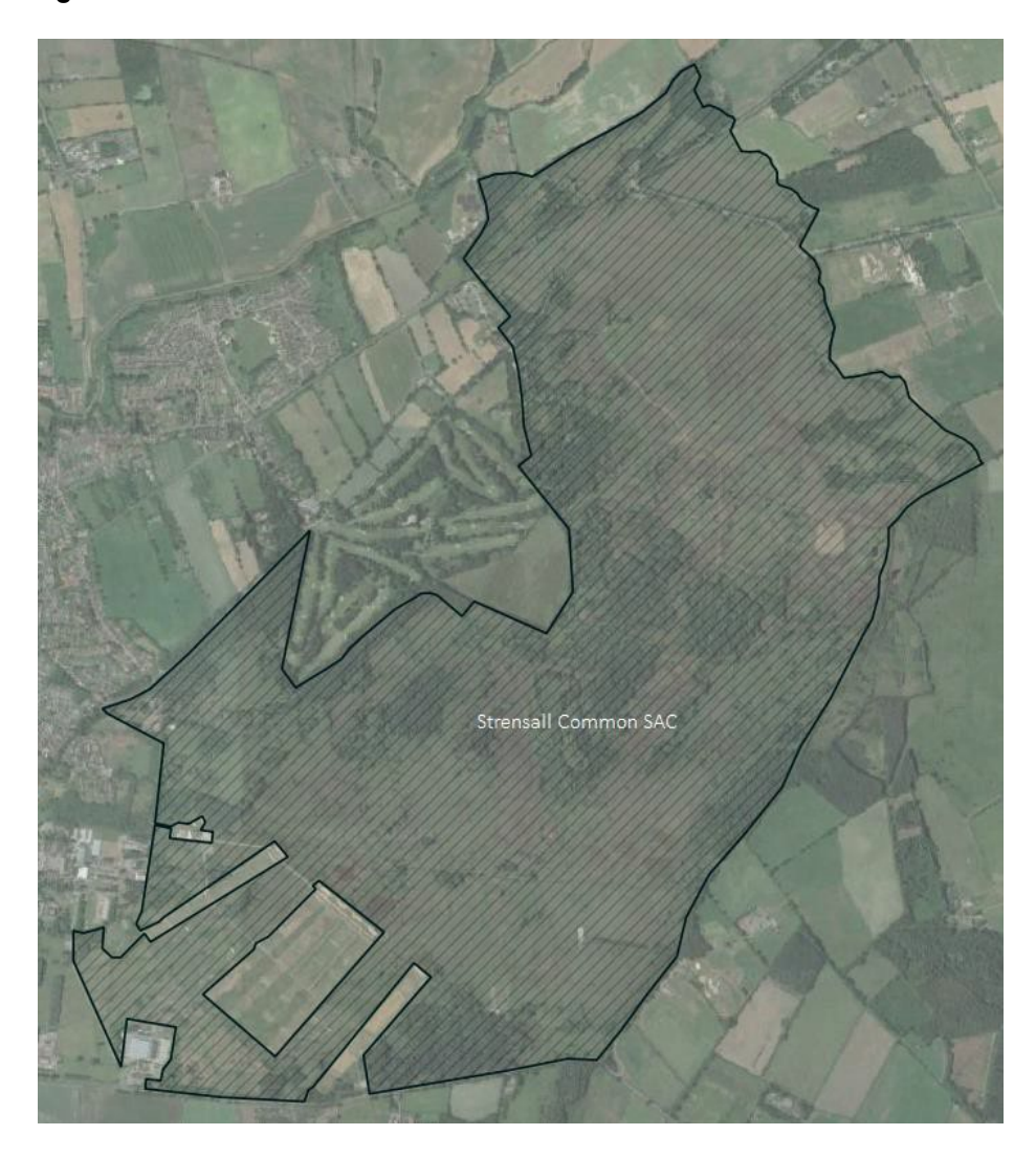
Figure 4 Strensall Common SAC