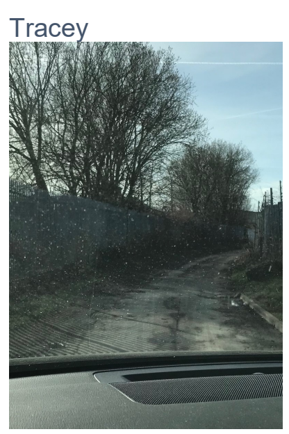
The access road

Having been to the site today I was profoundly shocked by the environment surrounding a housing settlement – the place was filthy with dust, inhospitable in the extreme, difficult if not unsafe to access, badly maintained road with no pedestrian access or lighting bordered by high metal fences and razor wire, and full of billowing dust - not in my view an acceptable location for anybody to live. I would strongly recommend that you all visit this site and that E Health undertake their own survey work on air pollution from the surrounding heavy industrial site – I had not appreciated the nature of the surrounding business area – Sorry but this has just deepened my unease with the suitability of any growth on this site. Please look at the pictures and consider whether this is equivalent to any other housing provision that we would permit anywhere in the city?