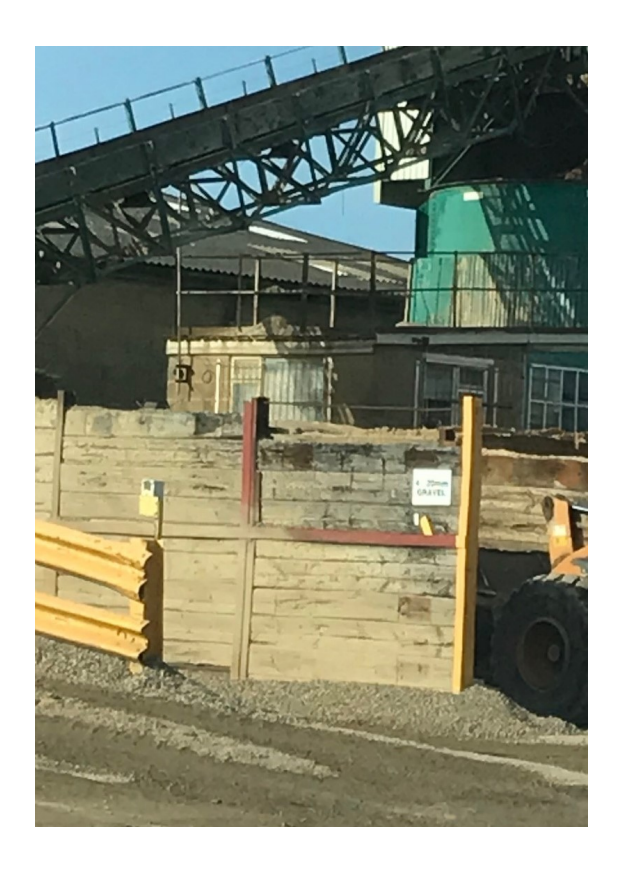
The adjacent neighbours