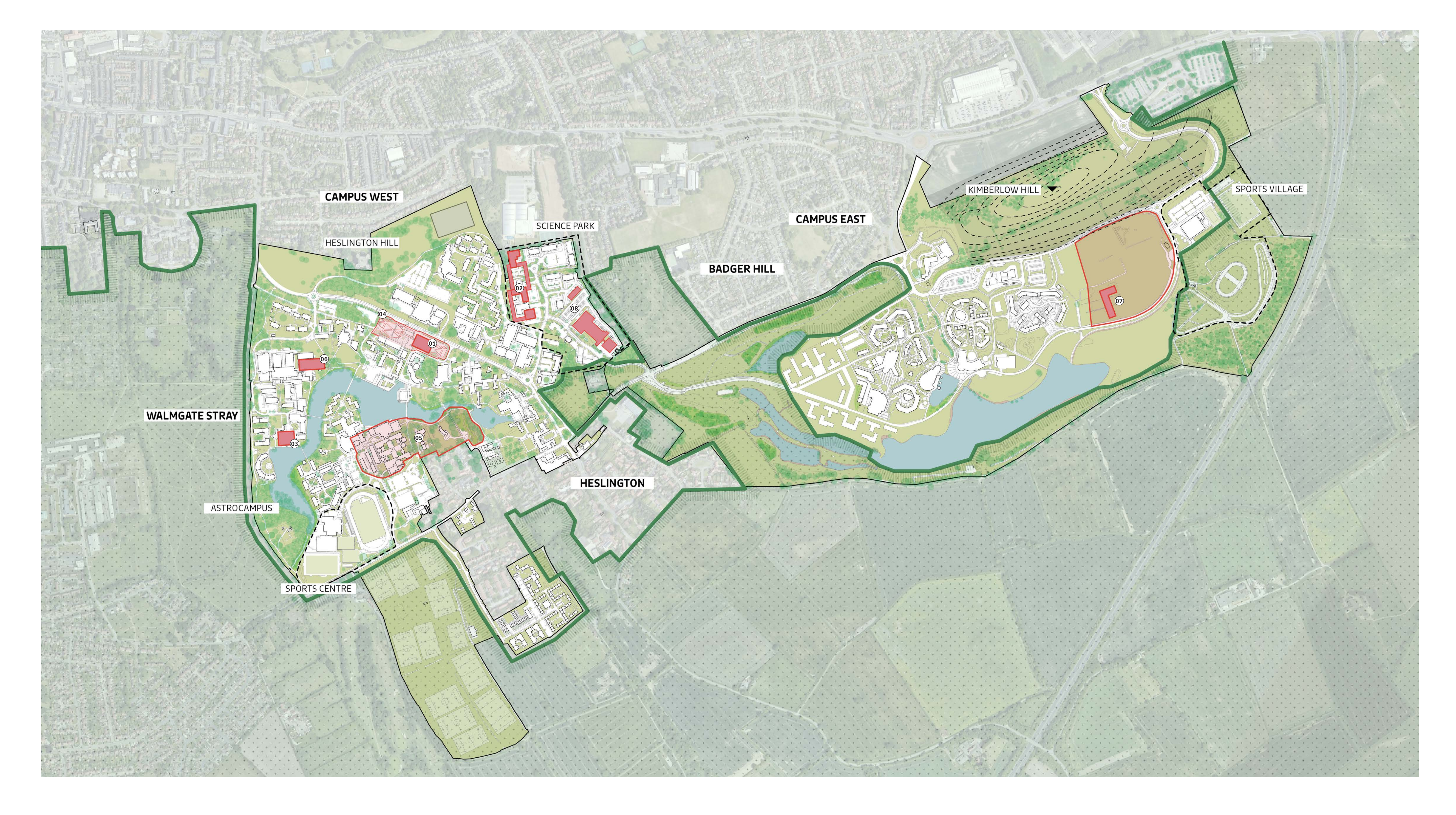
PLAN 04: COMMITED CAPITAL PROJECTS FORMING PART OF THE INTEGRATED INFRASTRUCTURE PLAN (APPROVED JULY 2022)