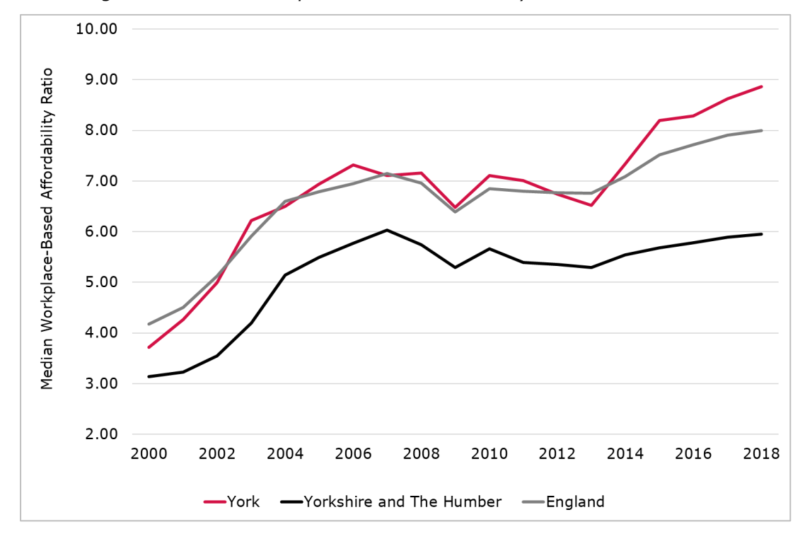
Figure 2: Median workplace based affordability ratio