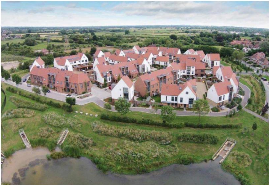
Developments face a Community Infrastructure Levy, sometimes in addition to a Section 106 payment.

13TH FEBRUARY 2023 BUSINESS LOCAL GOVERNMENT YORK