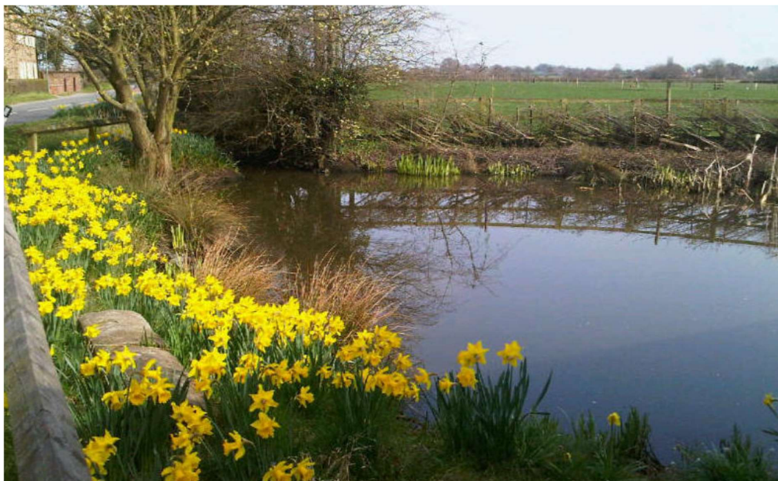
The Village Pond at Eastertime