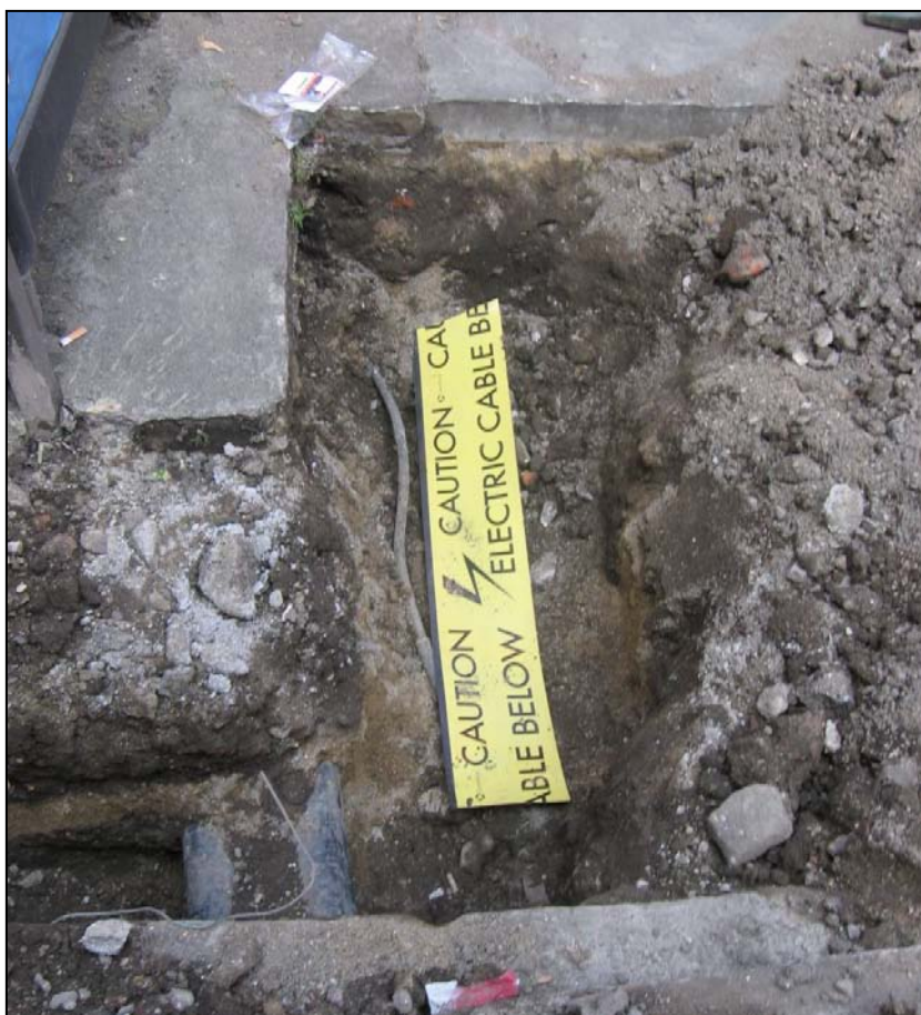
Plate 1 General view of trench, looking north-west