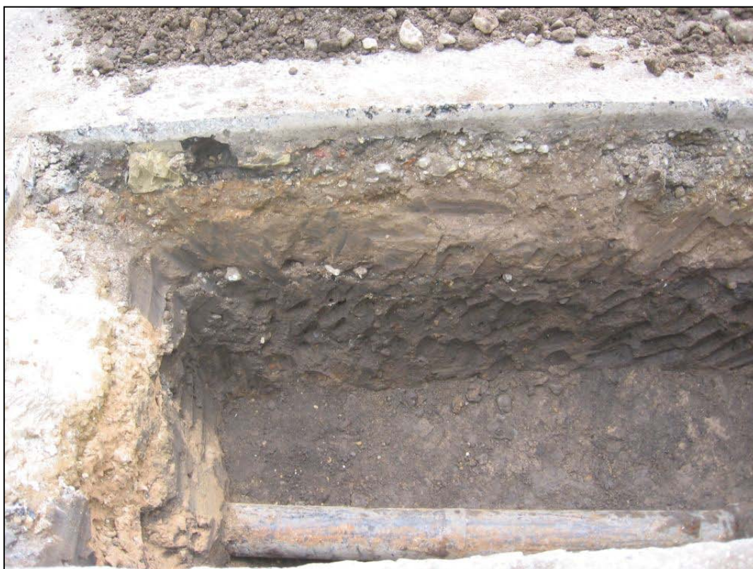
Plate 2 Deposits opposite Section 1, looking east

The lowest deposit recorded in this section, between 1.1m and at least 1.2m BGL, was a clean mid brown clay (1015). Overlying this was a 0.3m deep layer of mid greyish-brown clayey silt (1016) which was sealed by a 0.5m deep deposit of mid brown very slightly clayey silt with patches of mid orange clay and moderate brick / tile (1017). Above this was a 0.2m deep mixture of tarmac pieces, mid brown silt and cobbles (1018) forming the bedding for the modern road surface of tarmac (1019).