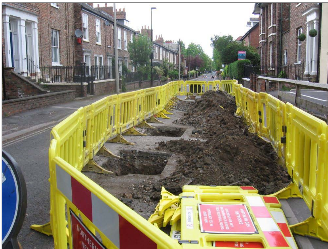
Plate 1 General view of southern end of works, looking north

The lowest deposit recorded in this section, between 1m and at least 1.3m BGL, was a dark greyish-brown slightly clayey silt (1007). Above this was a 0.7m deep layer of mid brownish-grey slightly clayey silt with occasional brick / tile and brown mortar (1008). This was sealed by a 0.2m deep deposit of dark brown slightly clayey silt with moderate brick / tile and pebbles (1009) which formed the bedding for the modern road surface of tarmac (1010).