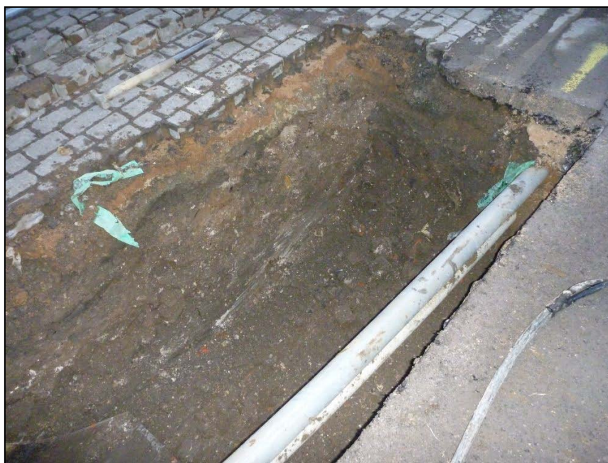
Plate 1 Modern deposits at top of trench, looking south-west