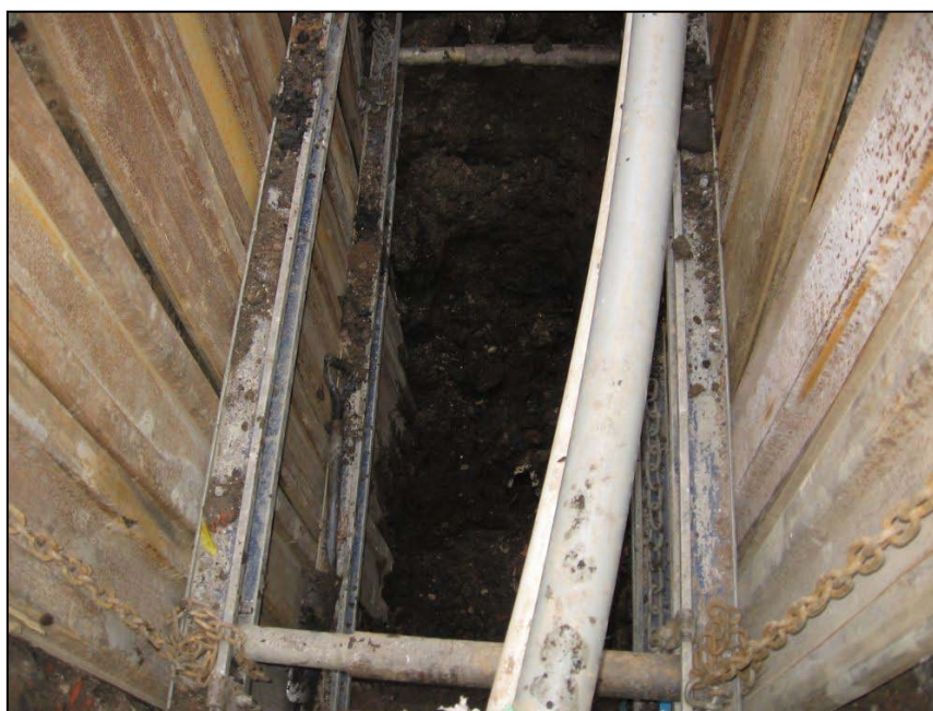
Plate 2 Vertical view of base of trench