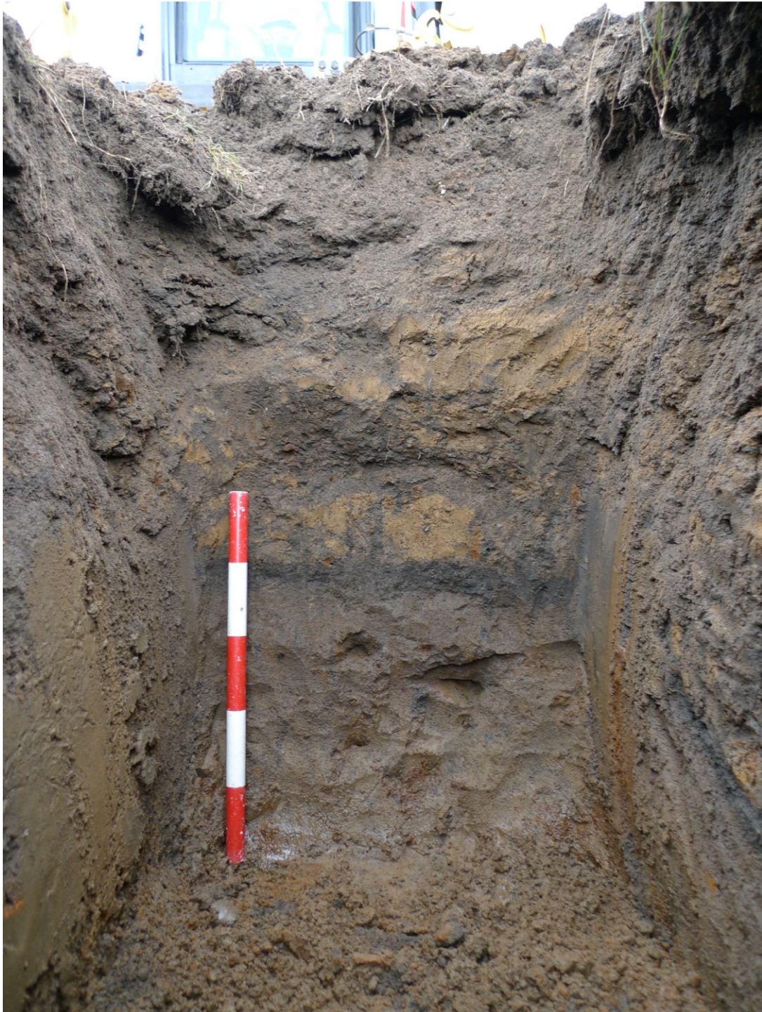
Plate 1 Dark band interpreted as a buried soil layer and buried subsoil, observed in Test Pit 9