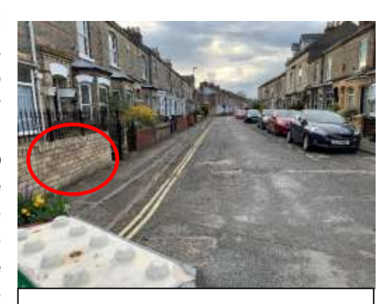
Photo 1 - Damage to wall belonging to 63 Brownlow Street, which is in Neville Terrace.

Throughout the scheme there appears to be a general lack of visible signing and provision of alternative routes for motorists entering "The Grove" area. This appears to be causing confusion with drivers, who, are possibly following their satellite navigation systems and then having to either carry-out three point turns or reverse into an adjacent side street. This was witnessed during the site visit. The situation is made worst by on-street vehicle parking leading to limited room for motorists to make these manoeuvres. The audit team are aware of the strike to the resident's wall at 63 Brownlow Street/ Neville Terrace (Photo 1) and the audit team witnessed vehicles reversing into St Johns Crescent from Penleys Grove Street. These injudicious vehicle manoeuvres could potentially lead to collisions with pedestrians, vehicles, cyclists and properties.